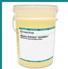
5-gallon pail SKU: WHAMEX-5G UPC-12: 641238027317