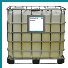
270-gallon tote SKU: WHAMEX-270G UPC-12: 641238033165

Master STAGES™ Whamex™ | ©2004-2024 Master Fluid Solutions® | 2024-04-25