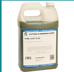
1-gallon jug SKU: VHPE320-1G UPC-12: 641238022350