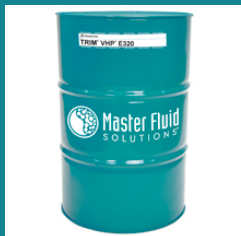
54-gallon drum SKU: VHPE320-54G UPC-12: 641238012252