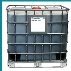
270-gallon tote SKU: VHPE320-270G UPC-12: 641238033844