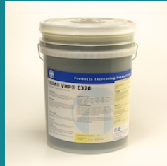
5-gallon pail SKU: VHPE320-5G UPC-12: 641238012245