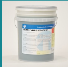
5-gallon pail SKU: VHPE200P-5G UPC-12: 641238011927