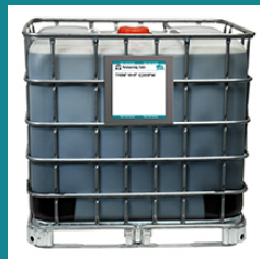
270-gallon tote SKU: VHPE200P-270G UPC-12: 641238036180