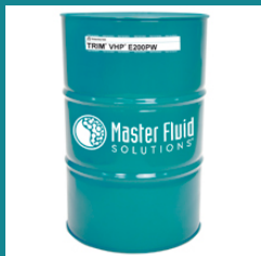
54-gallon drum SKU: VHPE200P-54G UPC-12: 641238011934