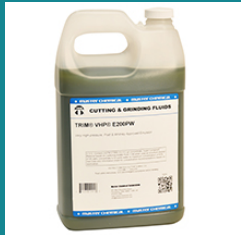
1-gallon jug SKU: VHPE200P-1G UPC-12: 641238024118