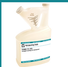
2-quart tip "N" measure ® SKU: TC253-2Q UPC-12: 641238078067