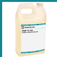
1-gallon jug SKU: TC253-1G UPC-12: 641238078098