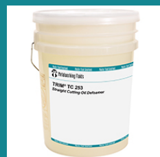
5-gallon pail SKU: TC253-5G UPC-12: 641238078081