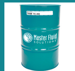
54-gallon drum SKU: TC253-54G UPC-12: 641238079903