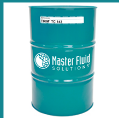
54-gallon drum SKU: TC143-54G UPC-12: 641238009757