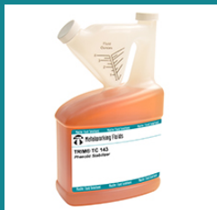
2-quart tip "N" measure® SKU: TC143-2Q UPC-12: 641238009726