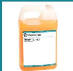
1-gallon jug SKU: TC143-1G UPC-12: 641238009696