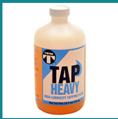
1-pint bottle SKU: TAPHVY-1P UPC-12: 641238009078