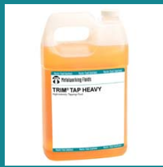
1-gallon jug SKU: TAPHVY-1G UPC-12: 641238008989