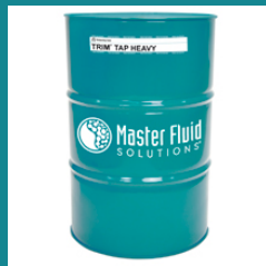
54-gallon drum SKU: TAPHVY-54G UPC-12: 641238009047