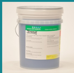
5-gallon pail SKU: SKRAMEX-5G UPC-12: 641238022947