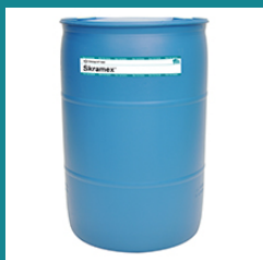
54-gallon drum SKU: SKRAMEX-54G UPC-12: 641238022954