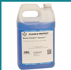
1-gallon jug SKU: SKRAMEX-1G UPC-12: 641238022923