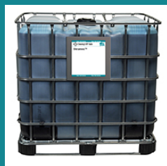
270-gallon tote SKU: SKRAMEX-270G UPC-12: 641238023012

Master STAGES™ Skramex™ | ©1999-2024 Master Fluid Solutions® | 2024-04-26