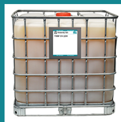
270-gallon tote SKU: OV2200-270G UPC-12: 641238070566