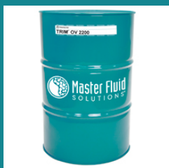
54-gallon drum SKU: OV2200-54G UPC-12: 641238070559