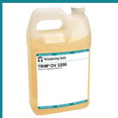
1-gallon jug SKU: OV2200-1G UPC-12: 641238070528