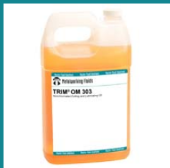
1-gallon jug SKU: OM303-1G UPC-12: 641238005919