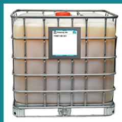
270-gallon tote SKU: OM303-270G UPC-12: 641238033820