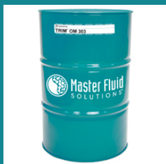
54-gallon drum SKU: OM303-54G UPC-12: 641238005957