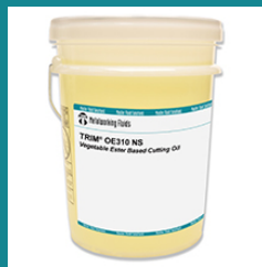
5-gallon pail SKU: OE310NS-5G UPC-12: 641238077473