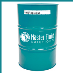
54-gallon drum SKU: OE310NS-54G UPC-12: 641238076728