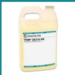
1-gallon jug SKU: OE310NS-1G UPC-12: 641238077497