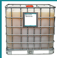
270-gallon tote SKU: OE310NS-270G UPC-12: 641238077510