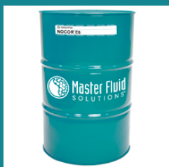
54-gallon drum SKU: NOCORE6-54G UPC-12: 641238042358