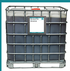
270-gallon tote SKU: NOCORE6-270G UPC-12: 641238042389