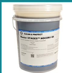
5-gallon pail SKU: NOCORE6-5G UPC-12: 641238042334