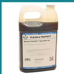
1-gallon jug SKU: NOCORE6-1G UPC-12: 641238042310