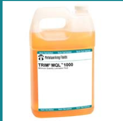
1-gallon jug SKU: MQL1000-1G UPC-12: 641238038559