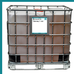
270-gallon tote SKU: MQL1000-270G UPC-12: 641238074779