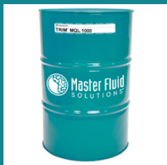
54-gallon drum SKU: MQL1000-54G UPC-12: 641238038597