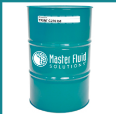
54-gallon drum SKU: C270BD-54G UPC-12: 641238001317