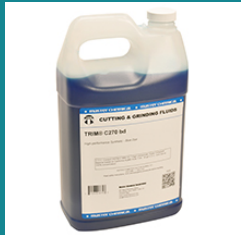
1-gallon jug SKU: C270BD-1G UPC-12: 641238066743