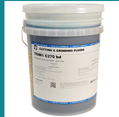
5-gallon pail SKU: C270BD-5G UPC-12: 641238001300