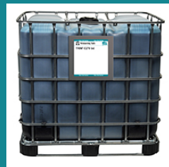
270-gallon tote SKU: C270BD-270G UPC-12: 641238034018